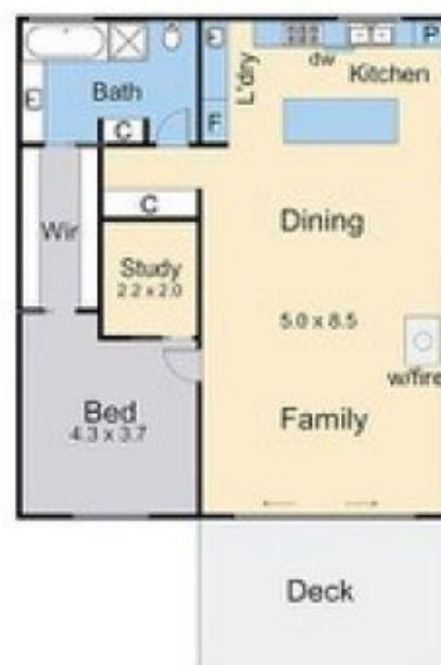
Self Contained Studio (Not In Position)

Residence area = 40.1 squares (approx) Studio area = 12 squares (approx) Stables area = 15 squares (approx)