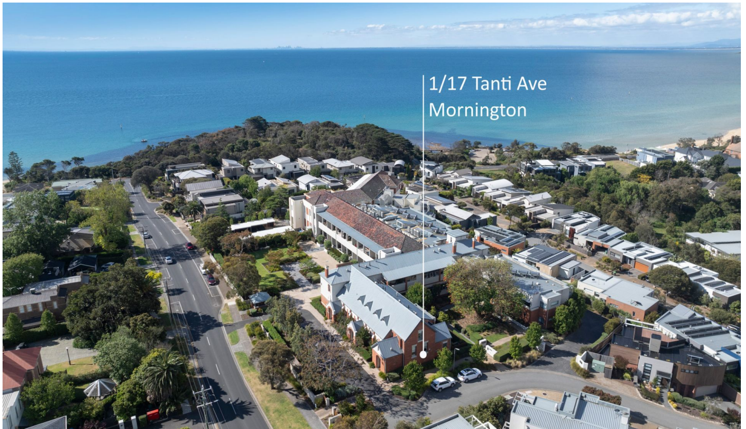
1/17 Tanti Ave Mornington