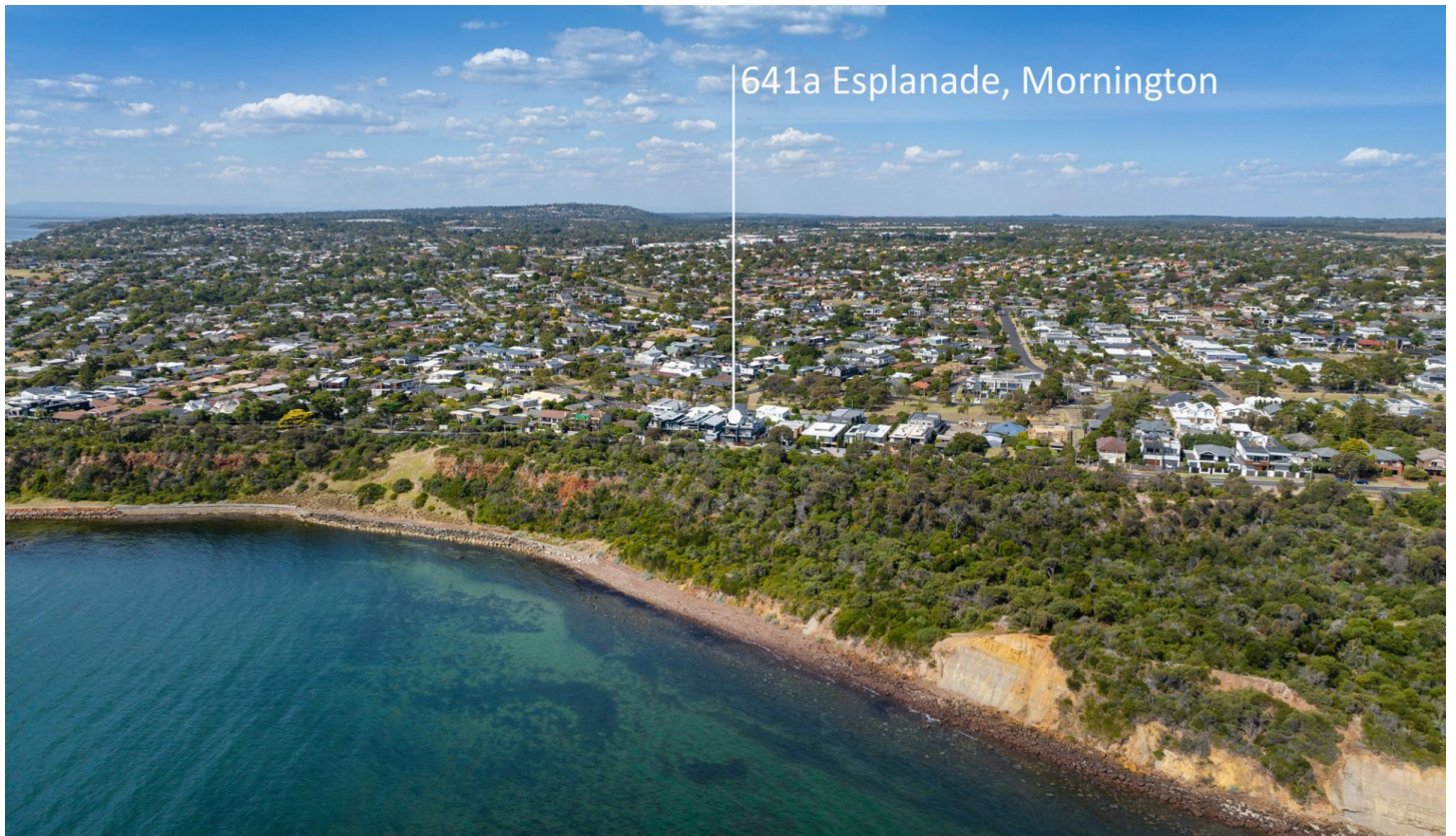
641a Esplanade, Mornington