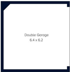
Basement (Not In Position)